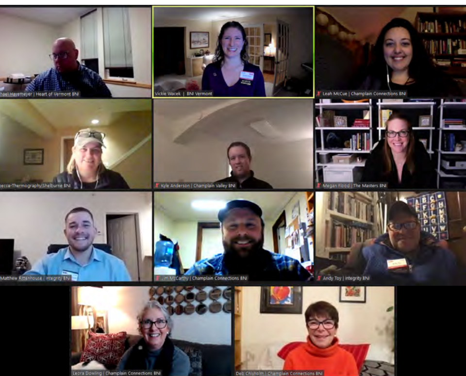
January 2021 New Member Skills Workshop Attendees.