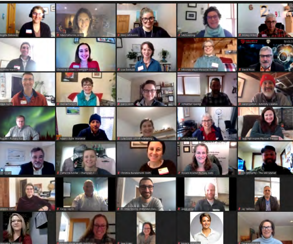
January 2021 Champlain Connections BNI Chapter Membership Success Program attendees.