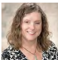
Jackie Budgor Residential Cleaning Blue Lotus Cleaning Champlain Valley BNI, South Burlington