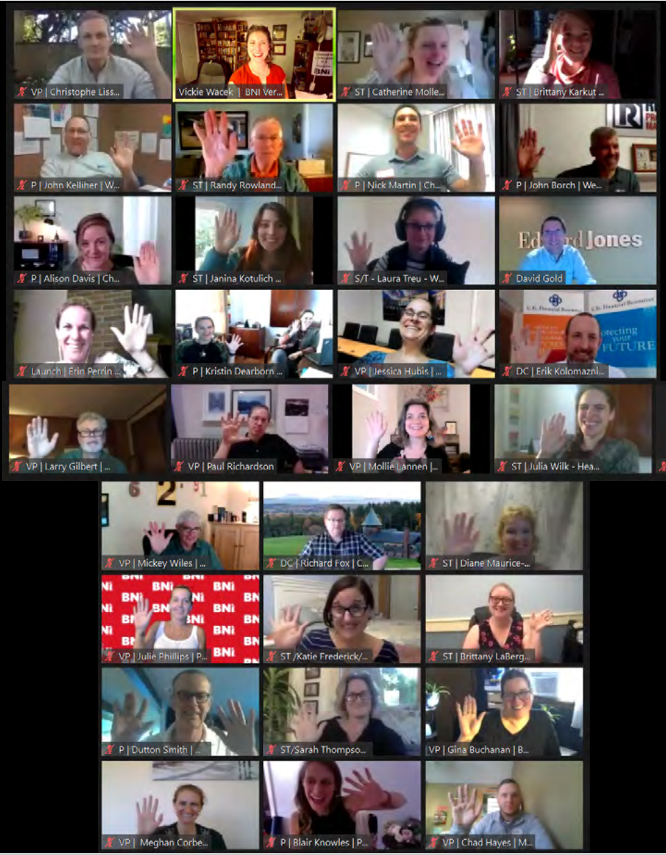
August Leadership Team Roundtable participants.