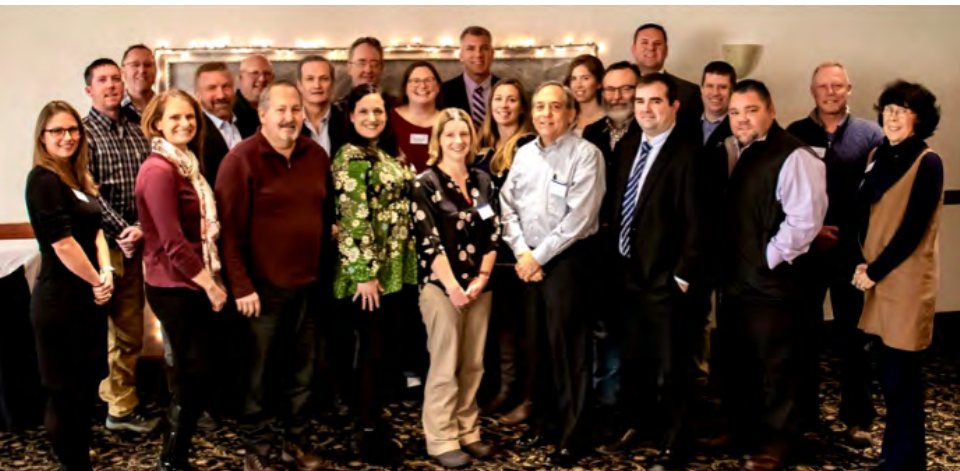
June 17, 2020 Wealth Builders Chapter Member Success Program Attendees!

Location for all New Member Skills Workshops: Virtually hosted until further notice