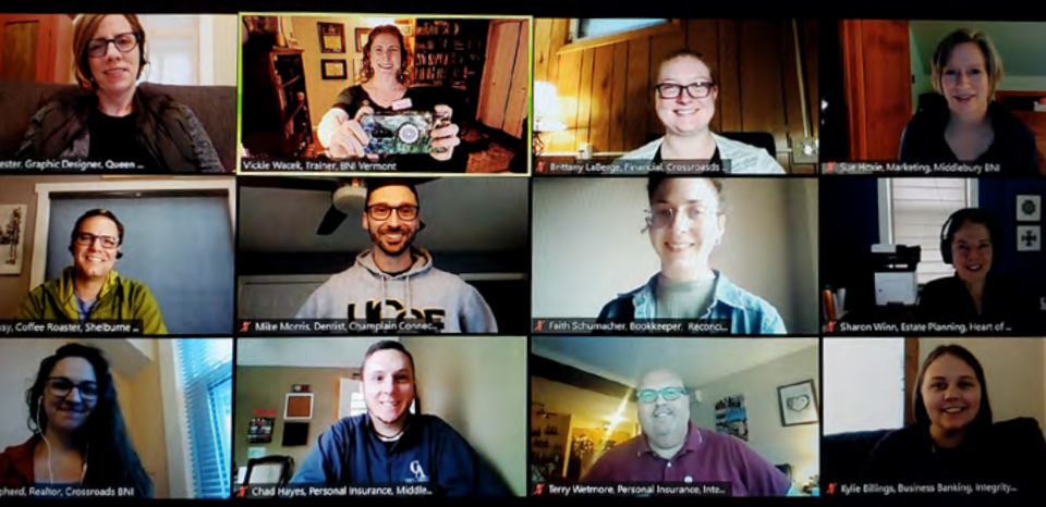
May 11, 2020 New Member Skills Workshop Attendees!