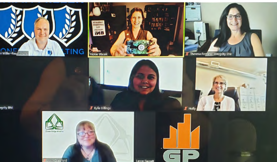
Integrity BNI Virtual Chapter Member Success Program Attendees!