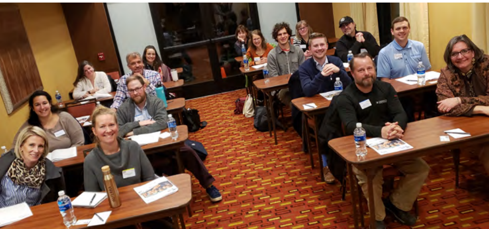
January 2020 New Member Skills Workshop Attendees.

Courtyard by Marriott, 177 Hurricane Lane, Williston